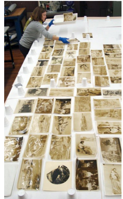
Maggie Wessling lays freshly washed photographs, recovered from a New Jersey coast home, out to air-dry