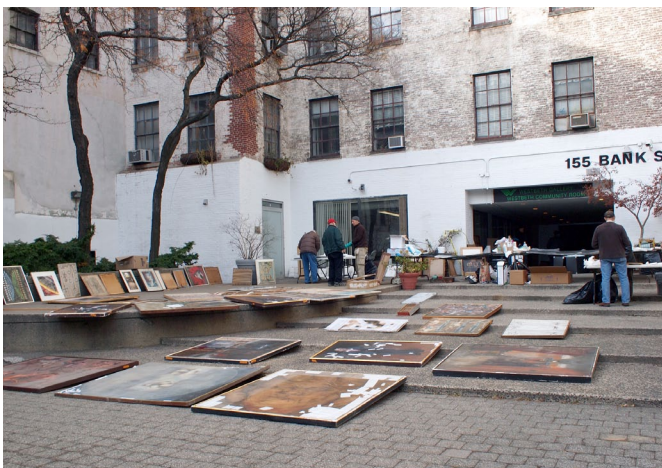
Paintings drying in the Westbeth courtyard